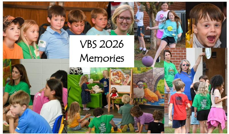
VBS 2026 Memories