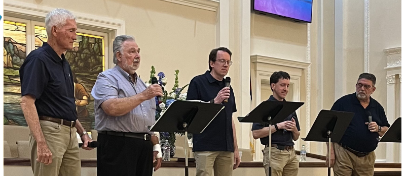
Men's Quartet, First Baptist Crestview, Florida